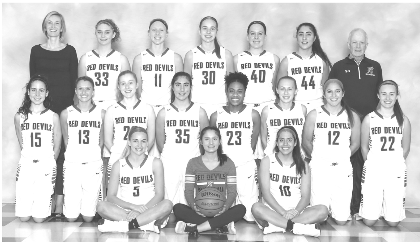
2017 Varsity Red Devils