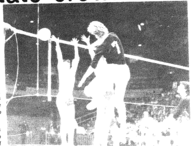
A spike—and a point.

It has been a long 23 years since Glenbard has had a State Champion. The Hilltoppers are the first girl's team to win a title and the 1960 Cross Country team was the first ever to win a title.